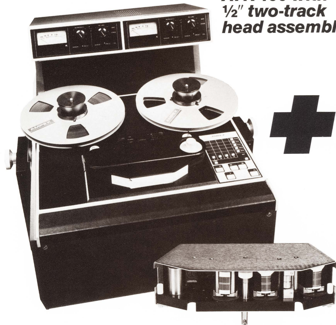
ATR-100 with 1/2" two-track head assembly