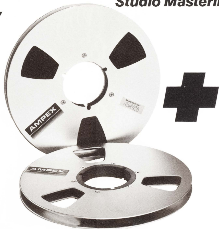
Grand Master™ Studio Mastering Tape